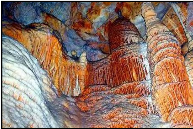
Indian Chamber in Orient Cave, Jenolan Caves, Australia.

were able to show that the clay had formed in the distant past from ash blown in from a nearby volcano.