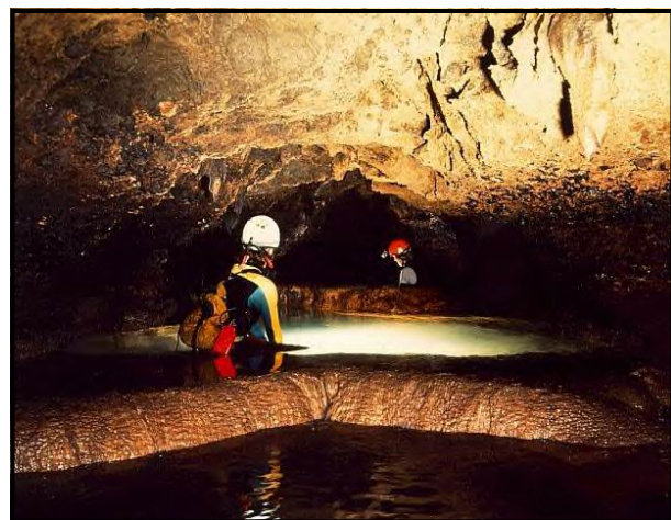
Honey Creek Cave