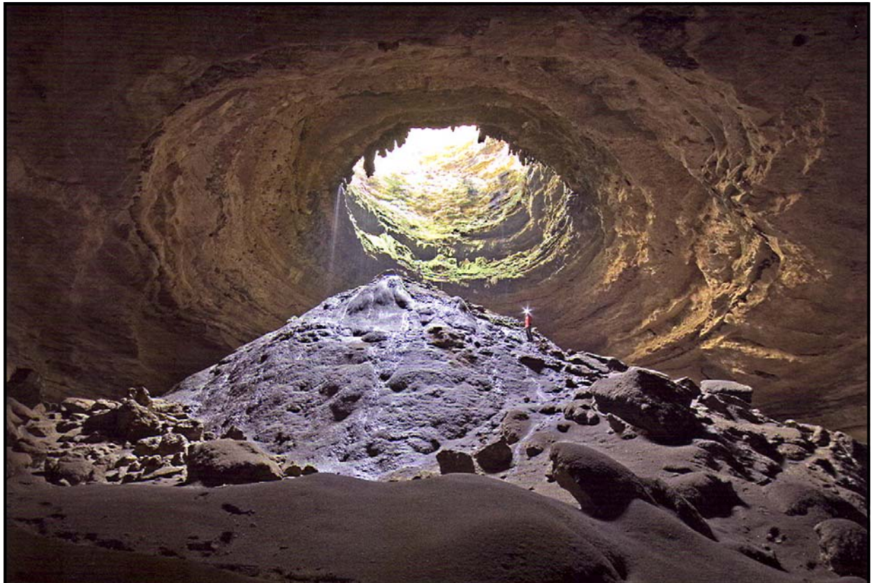
Devil's Sinkhole