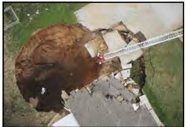
Aerial view of Nixa sinkhole.