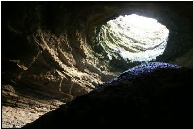
Devil's Sinkhole

Camp Masseuse Bottom (yeah, I know what your thinking but we run a clean operation here)