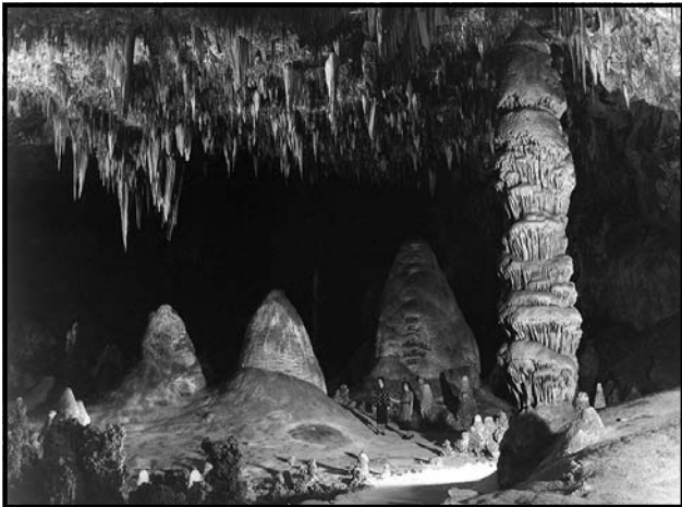
Big Room, Carlsbad Caverns